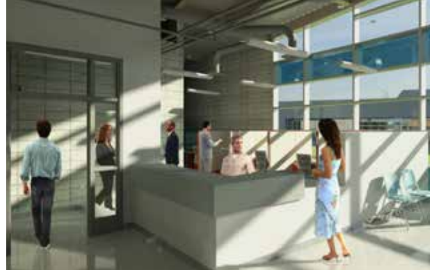
View of Sheriff's Lobby