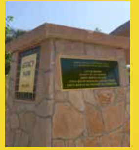
8. A proud donor to Legacy Park

1. A sea stack glows red at El Matador State Beach, just one of the jewels of Malibu's many public beaches and parks along its 21 miles of coastal beauty. 2. Looking east across Santa Monica Bay to Santa Monica with the giant coreopsis, a treelike shrub native to the Southern California coast as it wakes from its yearly sleep and shines in golden bloom. 3. The Fall 1980 Schedule of Classes featured more than 75 classes offered by Santa Monica College at the former Malibu Park Junior High School on the west end of Malibu and at locations in the Malibu Civic Center. 4. Malibu has fully embraced its status as the epicenter of surf culture. In 2010, Surfrider Beach near the Malibu Civic Center and on the north shore of Santa Monica Bay was named the globe's first World Surfing Reserve. 5. Malibu Creek starts at Malibou Lake and flows 13 miles while descending to Malibu Lagoon. Almost all of the Malibu Creek watershed falls within the Santa Monica Mountains National Recreation Area. 6. The SMC Malibu campus site is situated in an extraordinary physical environment of scrub sage, chaparral, and elfin forests of oak; a vast watershed ecology; a lagoon, wetlands, and riparian ecosystem; marine habitats; and geological strata. 7. There are more than 140 species of birds found at the Malibu Lagoon along with a diverse wildlife throughout the area. 8. Santa Monica College takes pride in its contribution towards the purchase of Legacy Park.