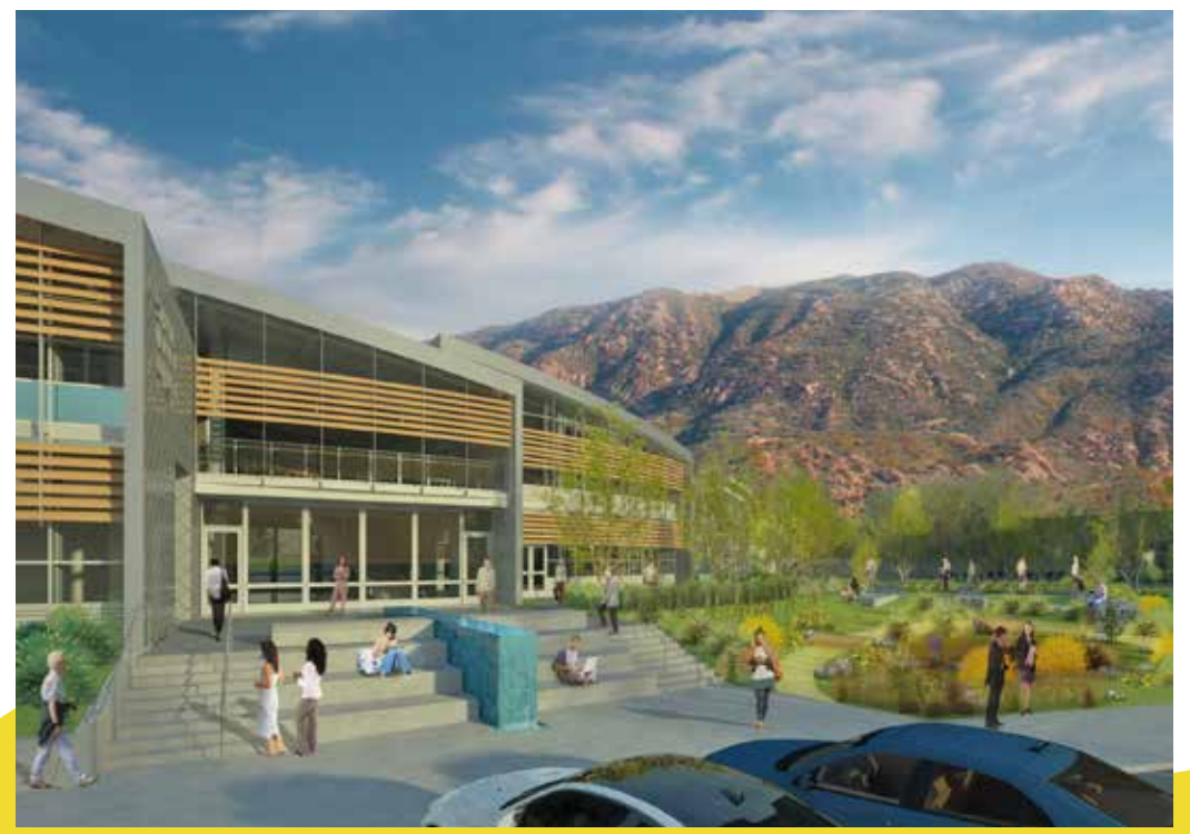
View of Main Entrance