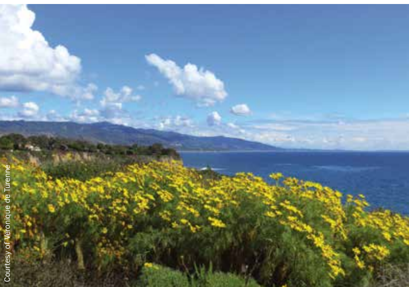
2. Looking east across the Santa Monica Bay