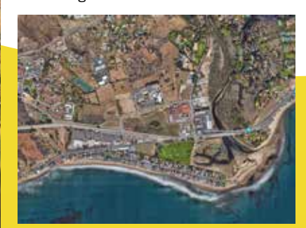
6. Malibu's majestic physical environment