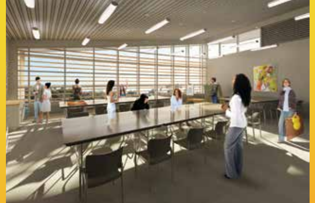
View of Flexible Art Classroom ▶