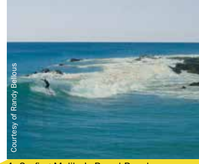
4. Surfing Malibu's Broad Beach