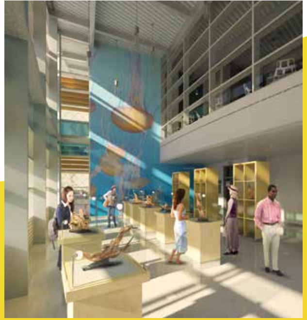
View of Interpretive Center