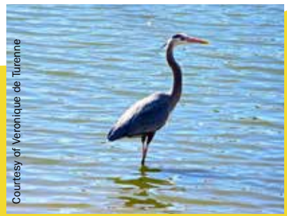
7. A sunbathing Great Blue Heron