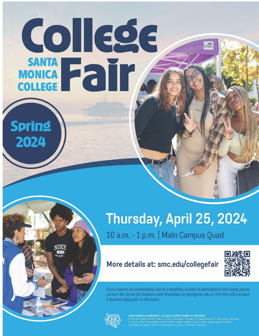
flyer advertising college fair