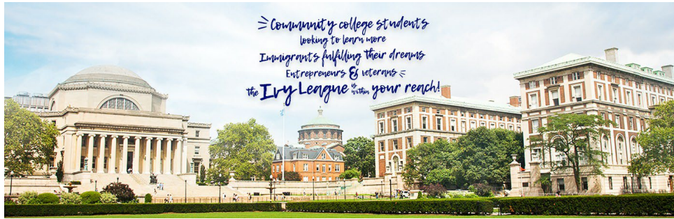
image of school building