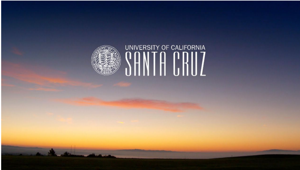
image of sky