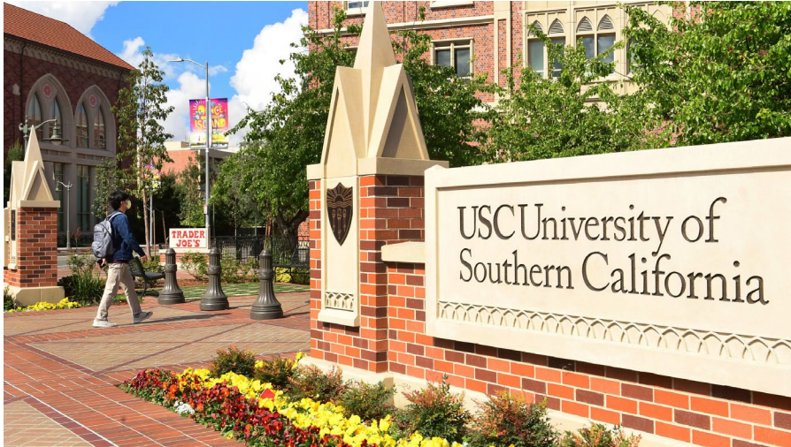
image of USC sign