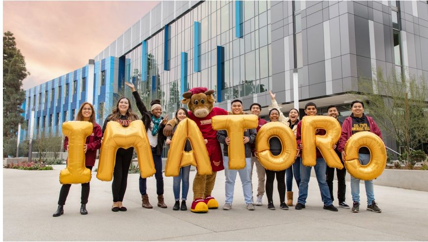
image of students