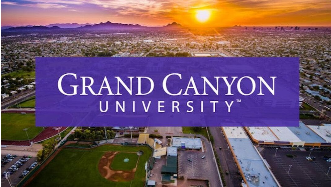
Image of grand canyon university

As the local University Counselor, I will be speaking about Grand Canyon University's online degree programs and upcoming cohorts. All participants will have a chance to schedule one on one appointments after the virtual information session.