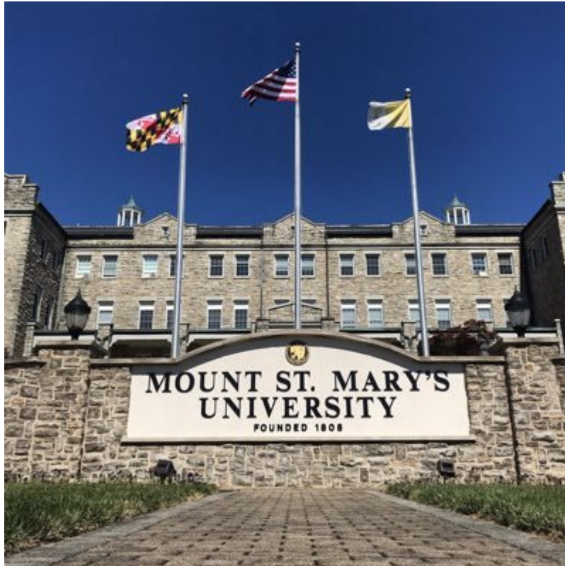
image of mount saint mary's university