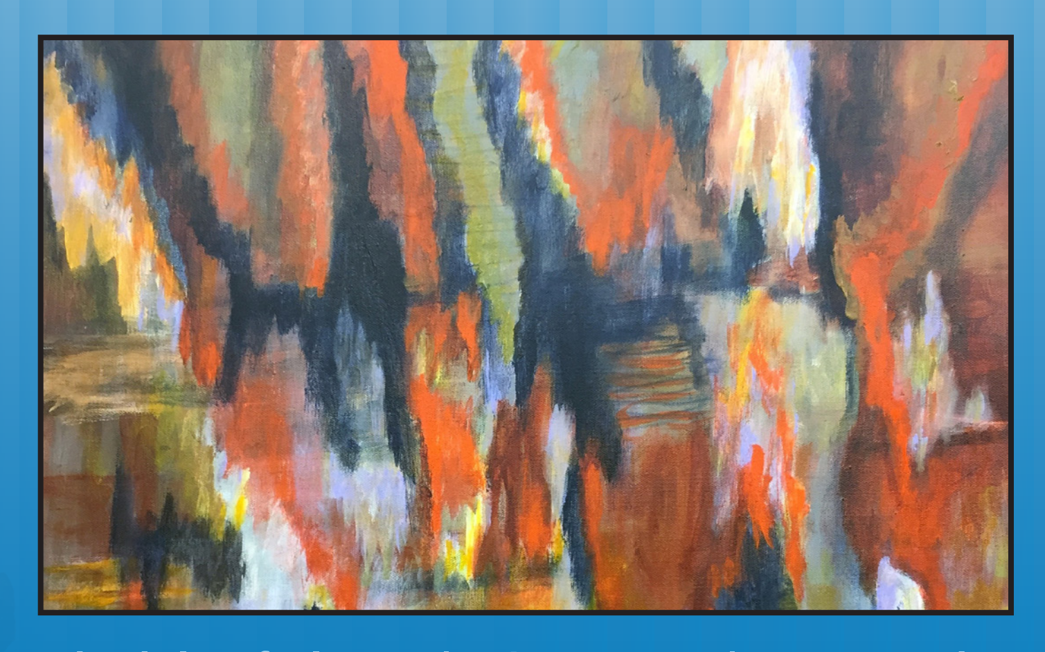
Schedule of Classes | Winter 2019 | Jan. 2 - Feb. 7