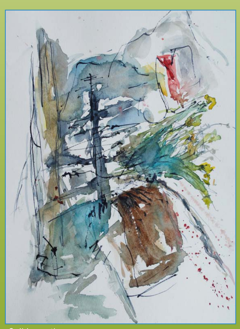
Gail Lonseth, Mountain Climbing Literally and Figuratively, watercolor/collage

Front Cover: Susan Katz, An Apple a Day, watercolor