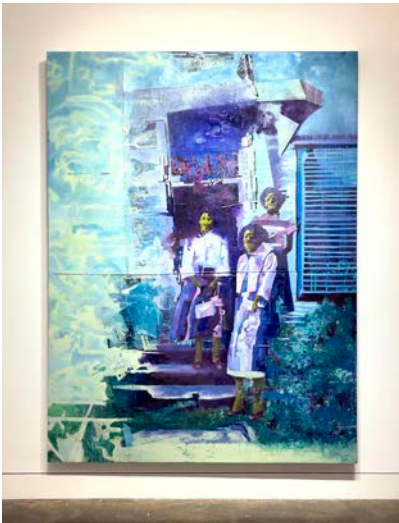
Cass Everage Sonnets of PG County Newsprint, Murrays, Beeswax, and oil on Canvas 6 ft x 8 ft 2024