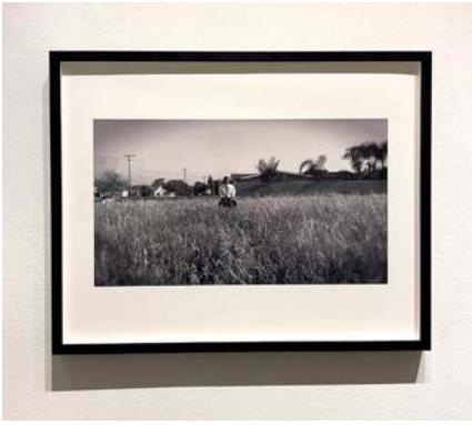
Donel Williams Job Interview Still image from video performance 25" x 32" 2015