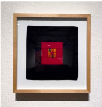
Lavielle Campbell Kente #4 Cotton 11" x 11 ¼" 2021