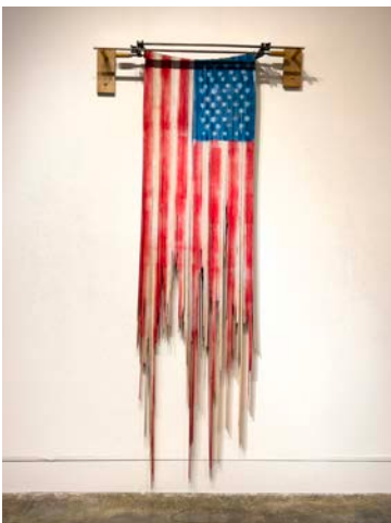
William Ransom You can't love your country only when you win Wood, clamps, and paint. 30" x 77" x 3" 2022