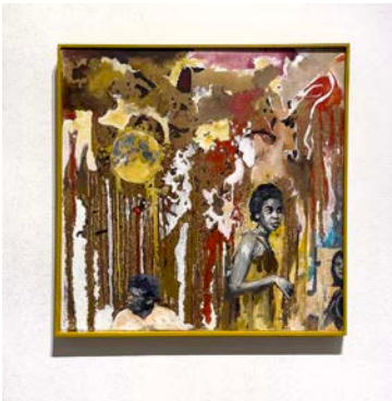
Michael Massenburg Three Views Collage and painting 24" x 24" 2015