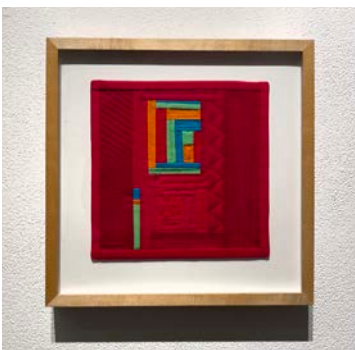
Lavielle Campbell A Little Red Cotton 11 ½" x 11 ½" 2021