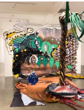
Alicia Piller Bloody Roots. Drowning. TILL Rescue. Vinyl, resin, paper, recycled green screen, inner tubes, recycled fabric and trim, wood, gel medium, crystal, glass, plastic, acrylic paint, foam, Billboard from the movie 'Till'. *Floor image: Gov. Desantis 11'4" x 13'10" x 14'5" 2024