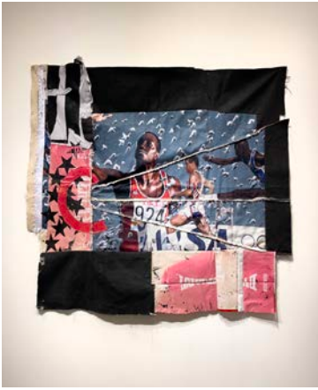
Cass Everage Untitled, Propaganda Quilt Repurposed fabric 5.8 ft x 4.7 ft 2023