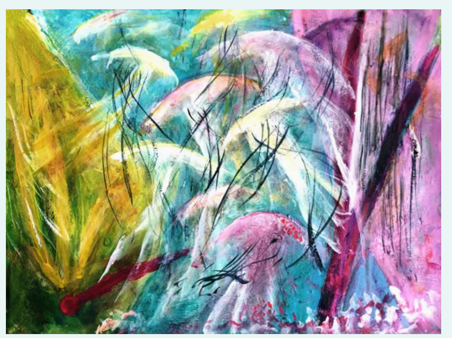
Bernice Glenn, A dream of of jellyfish 40 feet down, acrylic on paper 12" x 6"

All exhibitions are currently online. Visit <a href="mailto:smc.edu/emeritusgallery">smc.edu/emeritusgallery</a> for more information.